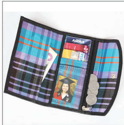
style #: MP032 Size: 6.75" x 4" Features: snap closure, zip pocket, ID holder, 4 card holders, 2 bill slots