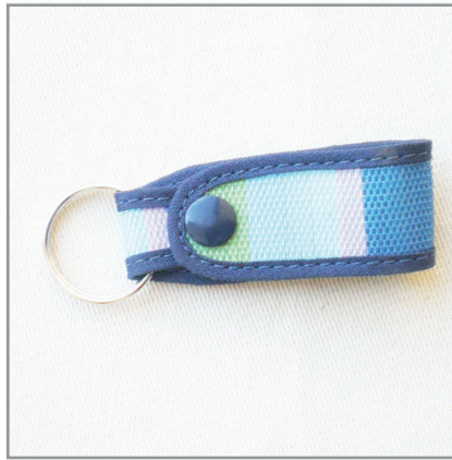
style #: 611 B Size: 3" x 1" Features: snap closure, key ring