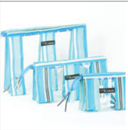
style #: 603V Size: 10"x7.5", 8.5"x4.5", 5.5"x4" Features: zip closure, nesting