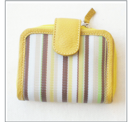
style #: SPO35 Size: 4.5" x 4", closed Features: snap closure, coin purse, bill holder, 8 card slots