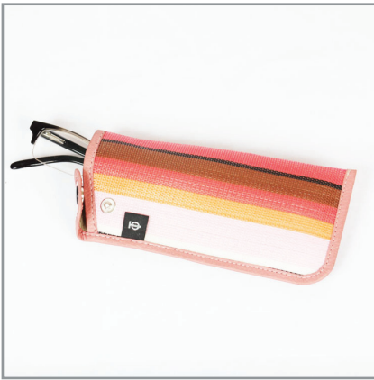
style #: SP098(L), SP061(S) Size: 7"x3.75"(L), 7"x3"(S) Features: fully padded, snap closure