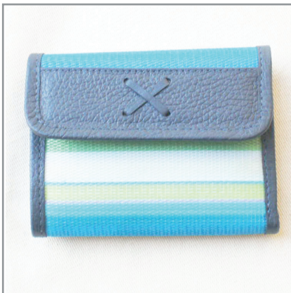
style #: SP003 Size: 5" x 3.75", closed Features: snap closure, bill holder, ID slot, 4 card slots