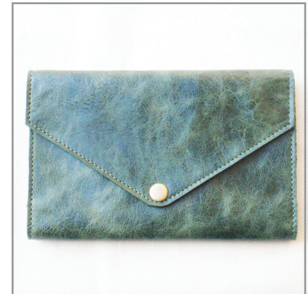
style #: GL/002S Size: 7" x 5" Features: snap closure, 2 bill holders, ID slot, 6 card slots, zip change purse